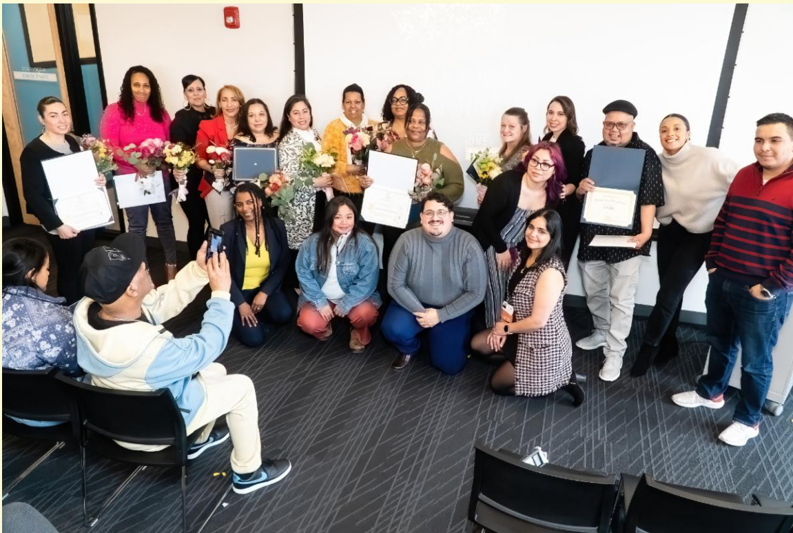
Mission Program graduates, mentors, and program leaders pose for a photo at CIC Providence on March 3.