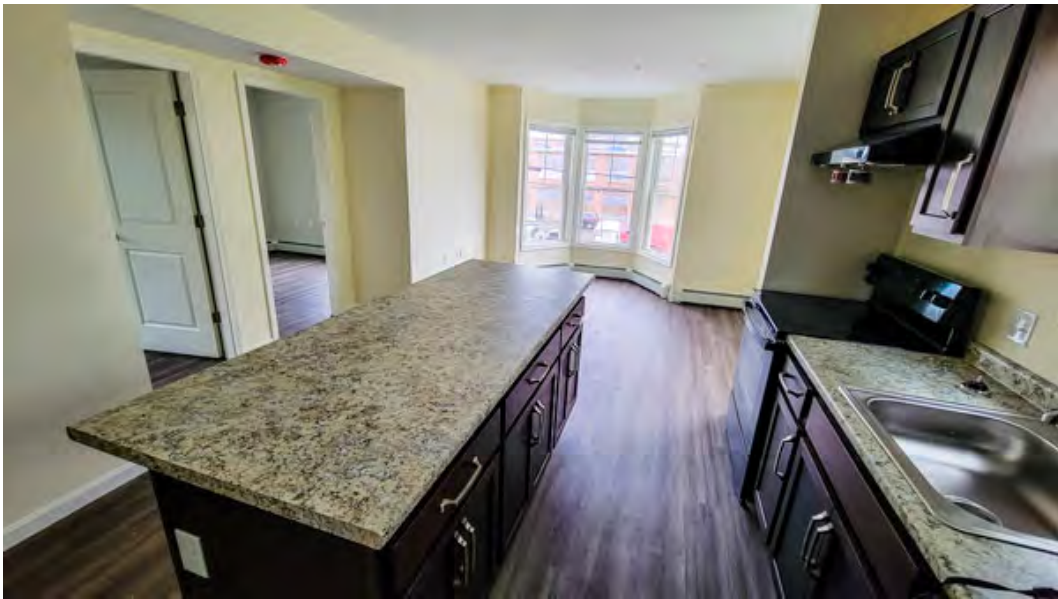
Above, the view from Delaine Street and a view inside a first-floor unit. Below, before and after photos of one of the Delaine Street buildings.