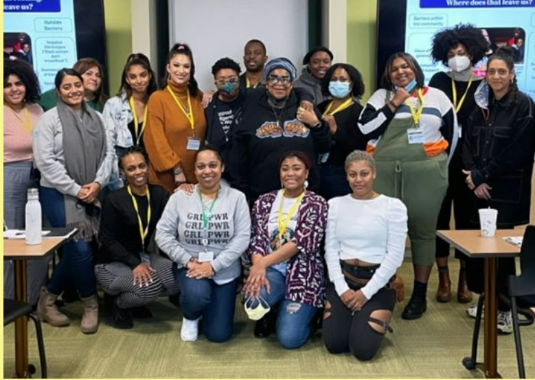
Participants in last year's Doula training.

We're excited about Our Journ3i's next doula training to be held from March 10-13. Our Journ3i's Doula Workforce Development Initiative strengthens the network of doulas living or working in the nine neighborhoods of 02908 and 02909, and is funded in part by ONE|NB's Central Providence Opportunities Health Equity Zone .